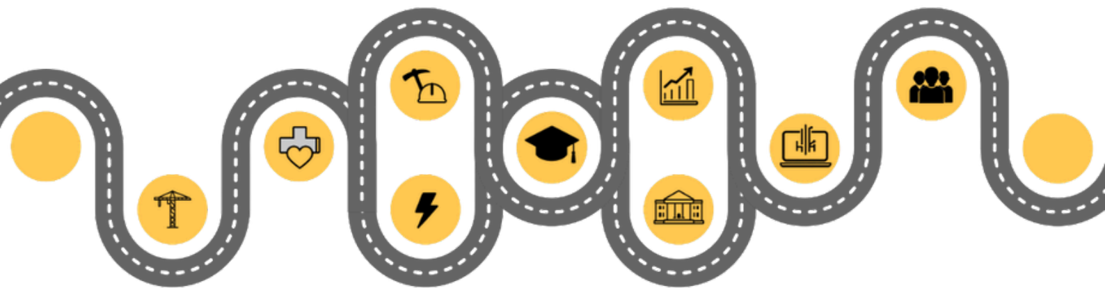
Sample of major WA sectors ready to activate

Facing multiple career paths, each with its own Industry Hub.